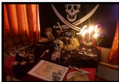
Table Set up Competition for the students of third year was held on 5th January 2019. Students displayed various Table setups based on the theme Valentine, Haunted, X'Mas, New Year, Easter & Pirates giving it a twist of innovation