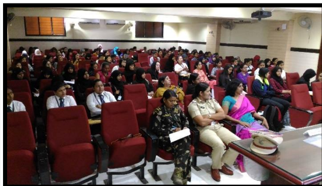
Session in progress