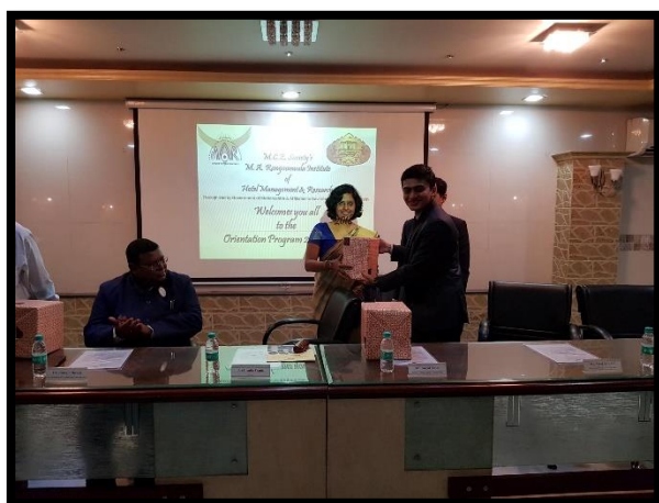
Felicitation of the guest by principal