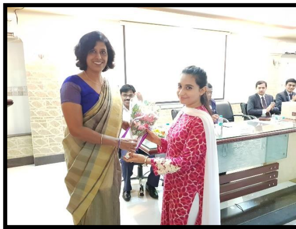
Felicitation of meritorious students