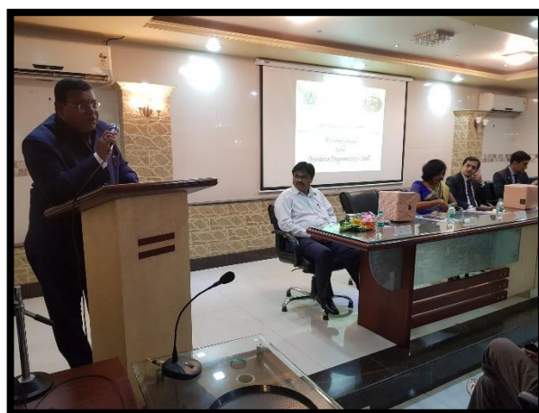
Session in progress