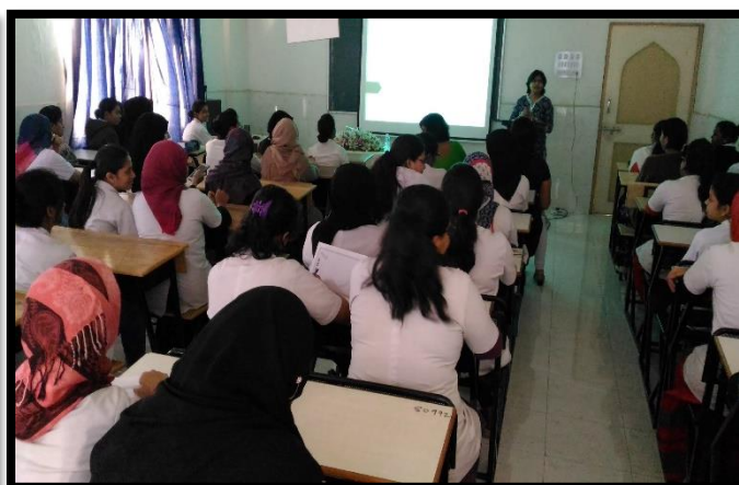
Session in progress