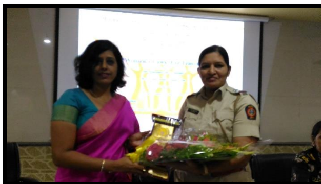
Felicitation of guest by principal