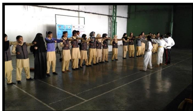
Session in progress