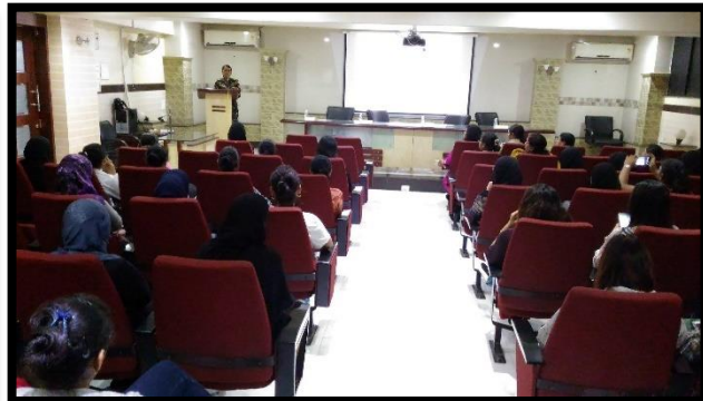
Session in progress