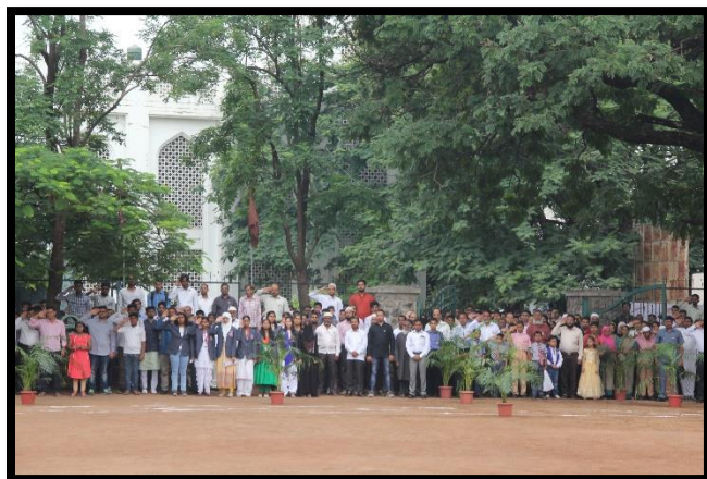
Students, teaching and non-teaching staff participation in flag hoisting