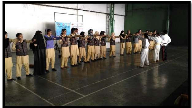
Session in progress