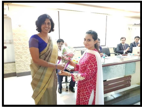
Felicitation of meritorious students