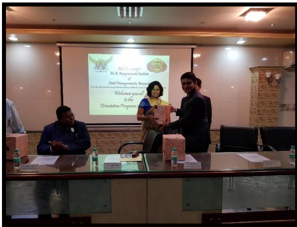
Felicitation of the guest by principal