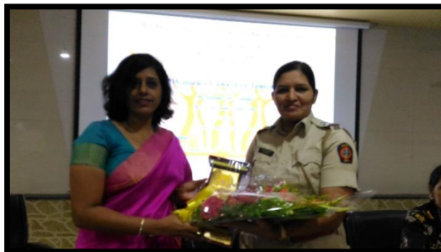
Felicitation of guest by principal