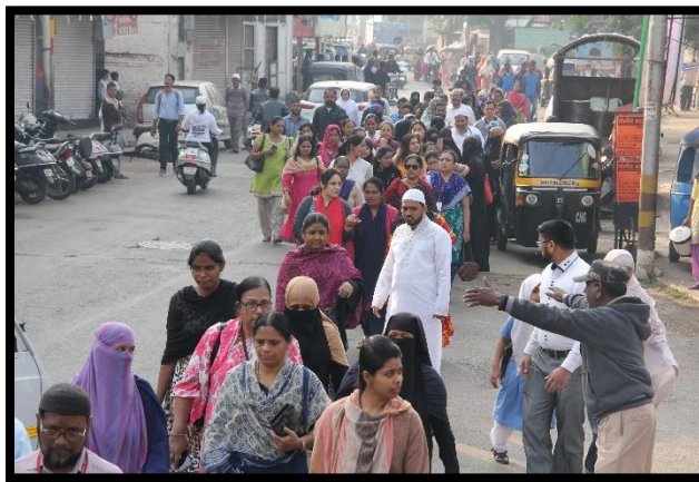
Participation of teaching and non-teaching staff in the rally

Students, teaching and non-teaching staff of M.C.E. Society's M.A.Rangoonwala Institute of Hotel Management and Research participated in the 'Eid Milad Un Nabi Rally' rally organized by Haji Gulam Mohammed Azam Education Trust, Azam Campus on 2nd December 2017. Students of M.A.Rangoonwala Institute of Hotel Management served the refreshments to students, teaching and non-teaching staff of the Azam Campus.