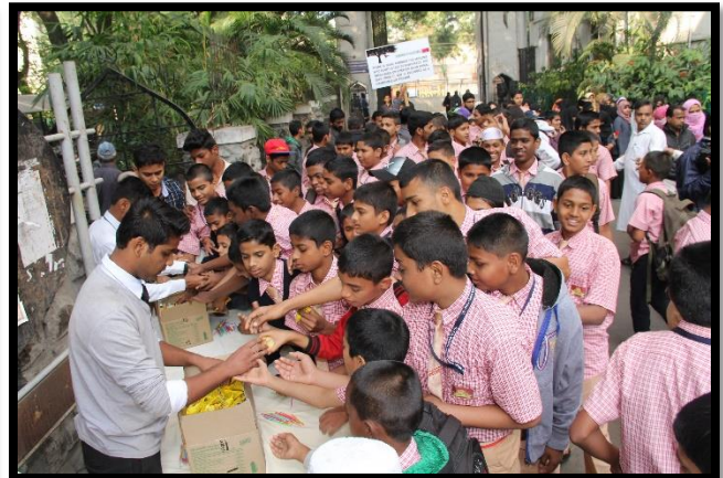
Distribution of refreshments after rally.