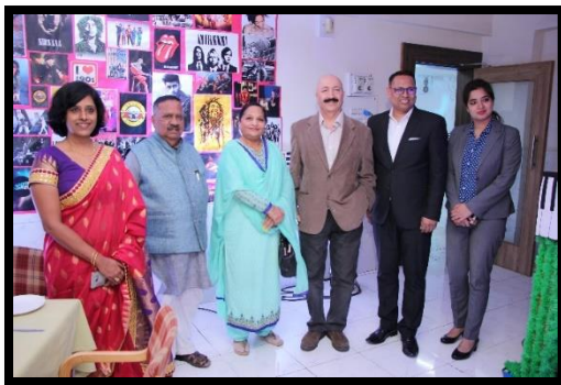
Group photo with guests