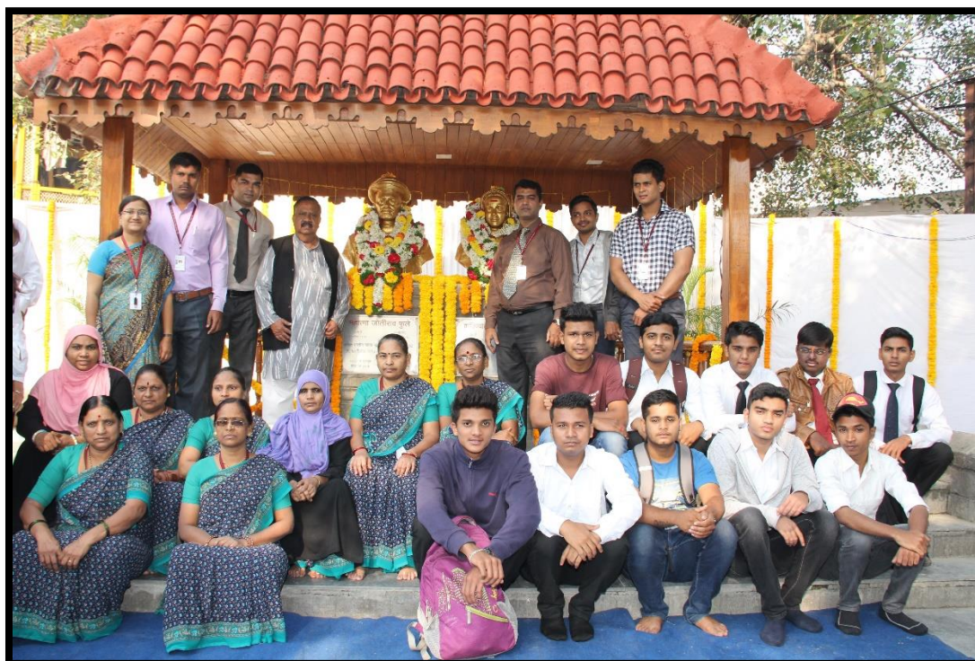
Students, teaching and non-teaching staff at Mahatma Jyotiba Phule Smarak

Rally was organized on 28 th November 2017 on the occasion of Death anniversary of Mahatma Jyotiba Phule by Azam Campus. Students, teaching and non-teaching staff of M.C.E.Society's M.A.Rangoonwala Institute of Hotel Management and Research participated in the rally to create awareness about the contribution of Mahatma Jyotiba Phule in the field of education.