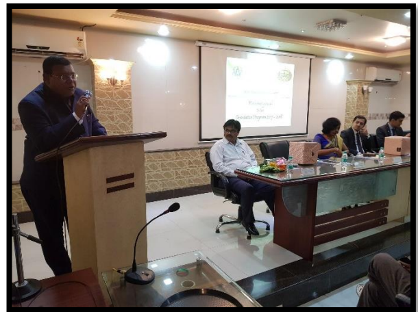
Session in progress