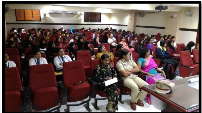
Session in progress