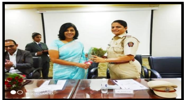
Felicitation of guests by principal