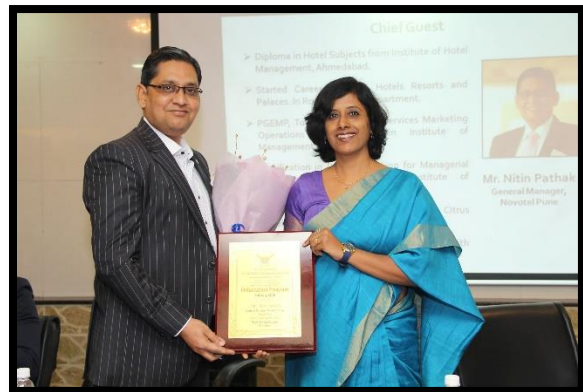
Felicitation of guest by principal