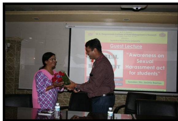
Felicitation of guest