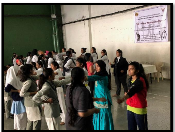
Session in progress