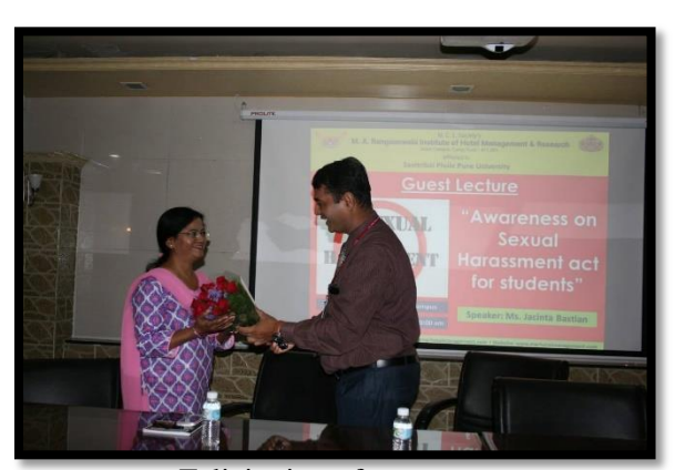
Felicitation of guest