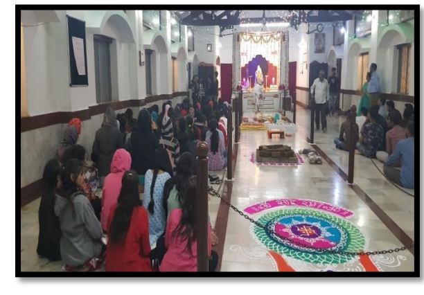
Cleanliness drive at Sai Seva Dham