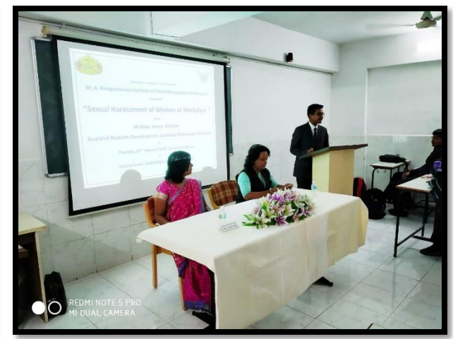
Session in progress