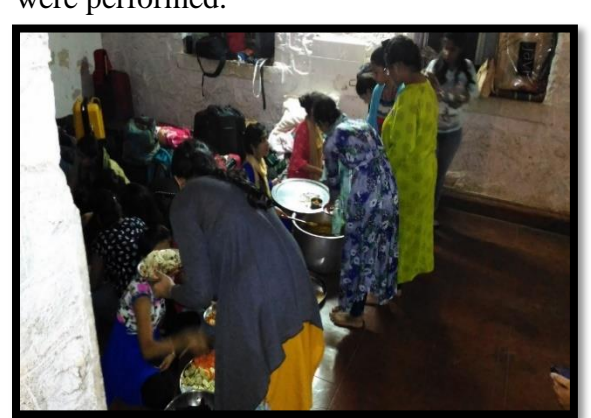
Service of food at Sai Seva Dham

The NSS special winter camp of M. A. Rangoonwala Institute of Hotel Management & Research was organized at Chikhalse Village, Tal. Mawal, Pune. The camp was scheduled from Saturday, 08th December to Friday, 14th December 2018. The theme of the camp was 'Jalsandharan and Jalsanrakshan'. Various activities like service of food and cleanliness drive at Sai Seva Dham, Shramdaan, workshop on disaster management, Books distribution at Zilla Parishad Shala were performed.