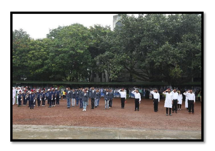
Students, teaching and non-teaching staff participating in flag hoisting ceremony