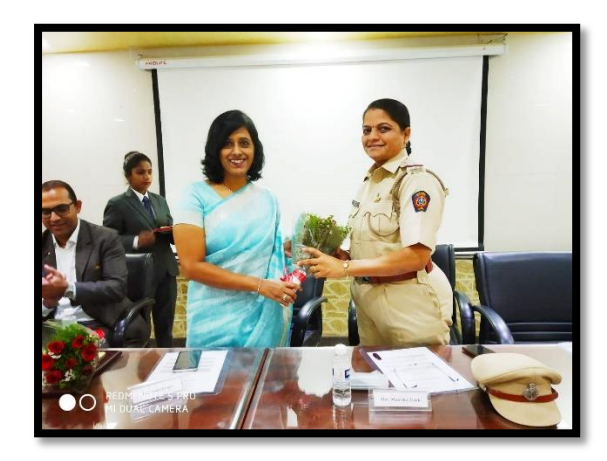
Felicitation of guests by principal