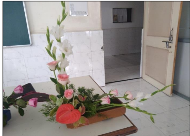
One of the flower arrangement