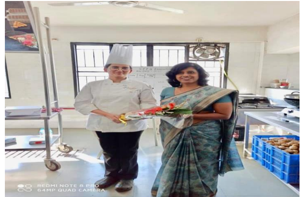
Felicitation of guest by Principal Madam