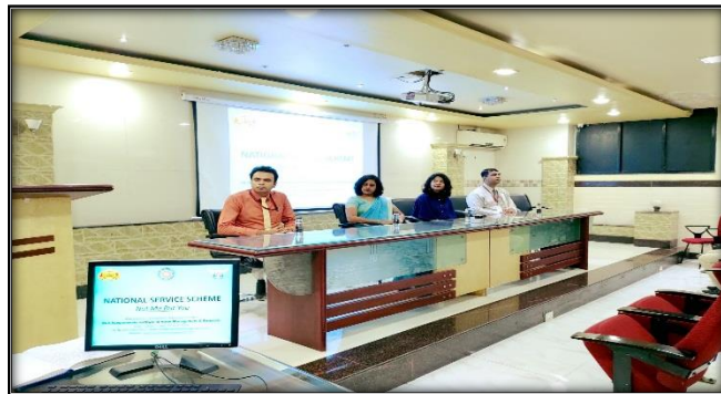
Session in Progress