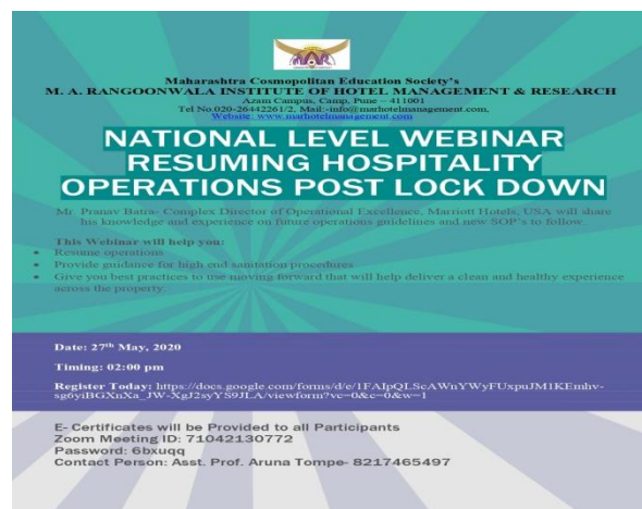
Poster of the Event