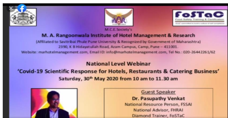
Poster of the Event