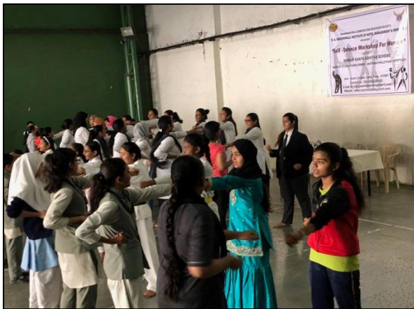
Practice session with participants