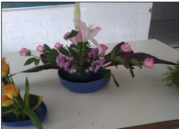
One of the flower arrangement