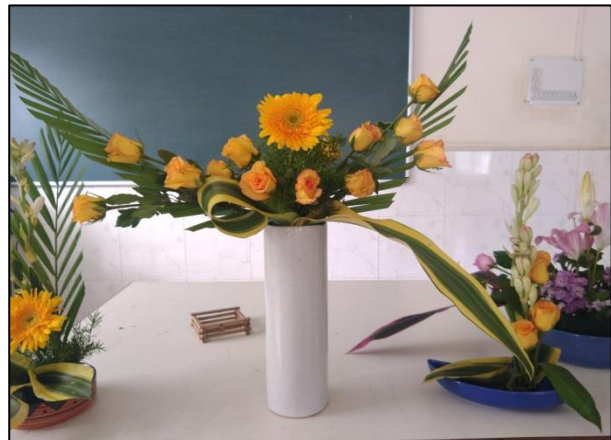
One of the flower arrangement