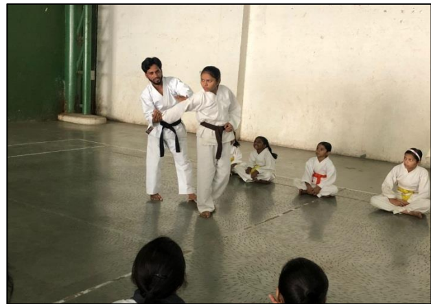
Demonstration of Self-Defence Techniques