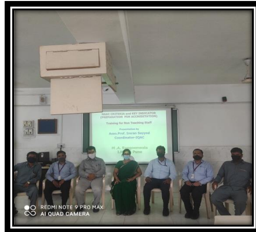
Group Photo with Principal