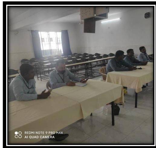
Online test for the staff on NAAC