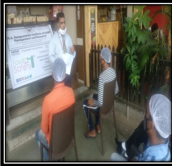
Training Session in progress