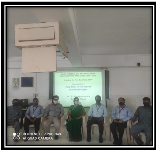
Non-teaching staff with trainer and Principal