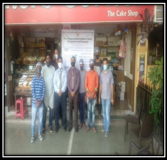
Group Photo of the bakery staff