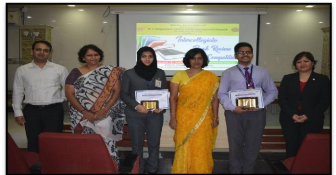
Photo with Winners