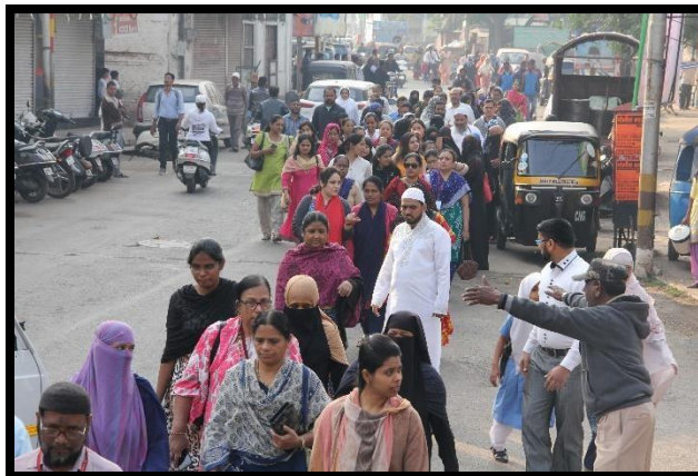
Participation of teaching and non-teaching staff in the rally