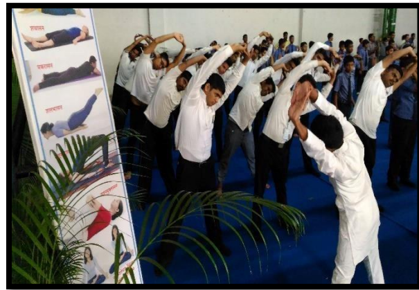
Students performing Yoga