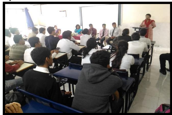
Guest addressing the participants