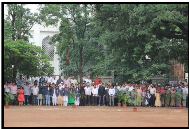
Students, teaching and non-teaching staff participation in flag hoisting