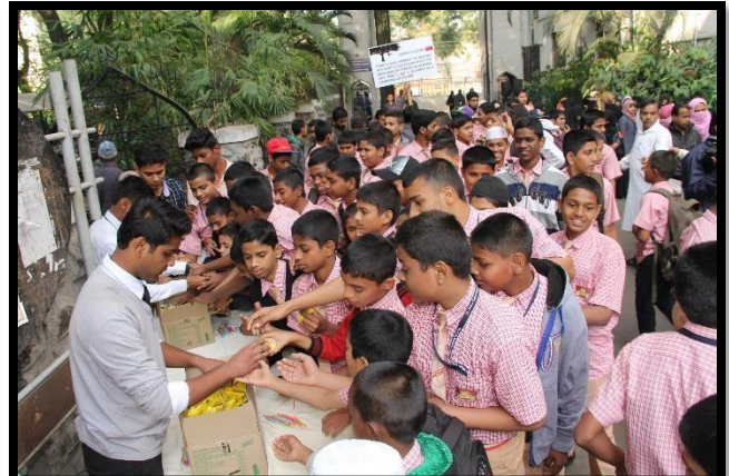
Distribution of refreshments after rally.