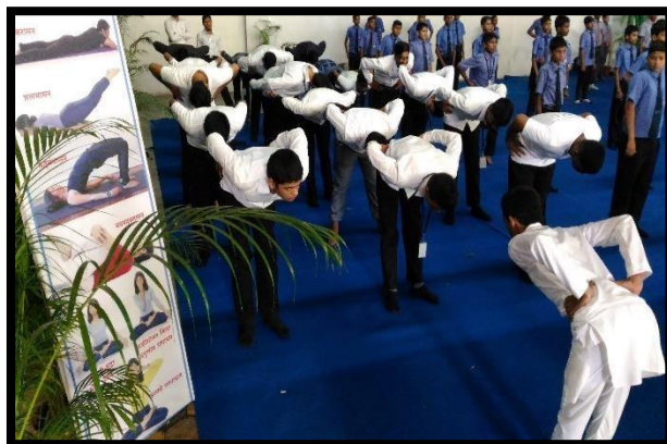
Students performing Yoga