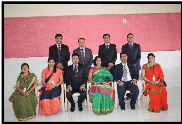
Faculty group photo

M.C.E. Society's M.A.Rangoonwala Institute of Hotel management and research celebrated Teachers Day on the occasion of birth anniversary of Dr. Sarvapally Radhakrishnan, second Prime Minister of India.