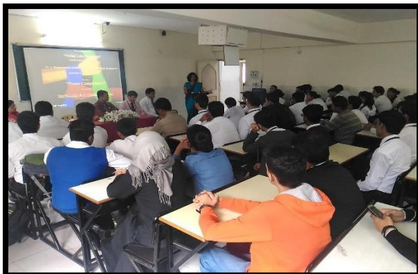
Principal Addressing the students