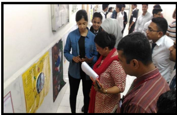
Students presenting the posters