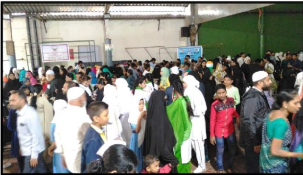
During the Event