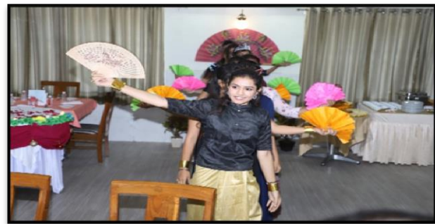
Thai Dance by Students