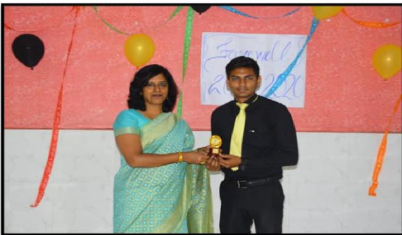
Giving mementos by Principal