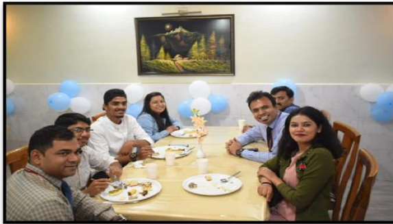
Lunch With Alumni

M.C.E Society's M.A. Rangoonwala Institute of Hotel Management and Research organized Alumni Meet 2020 on 27th February 2020.