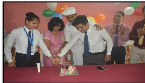
Cake cutting with toppers (T.YB.Sc HS)