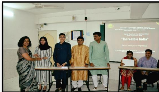
Prize Distribution by Principal