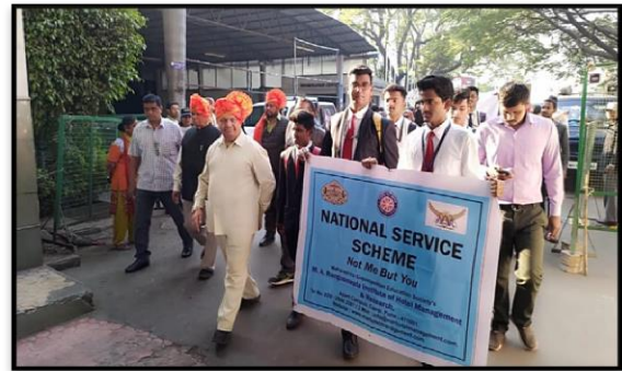
During the Event