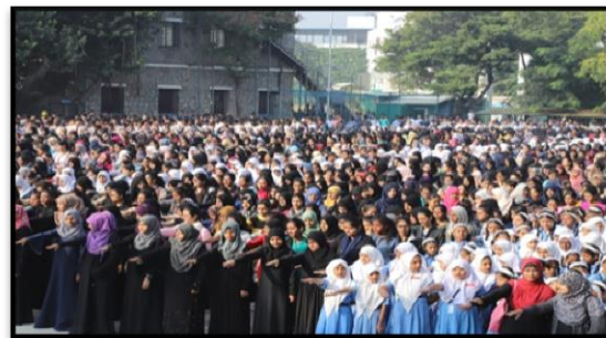
During the Event