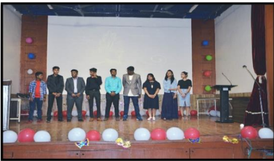
During the event