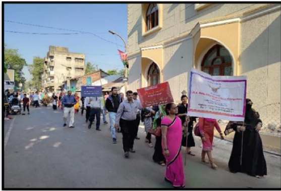
During the Event