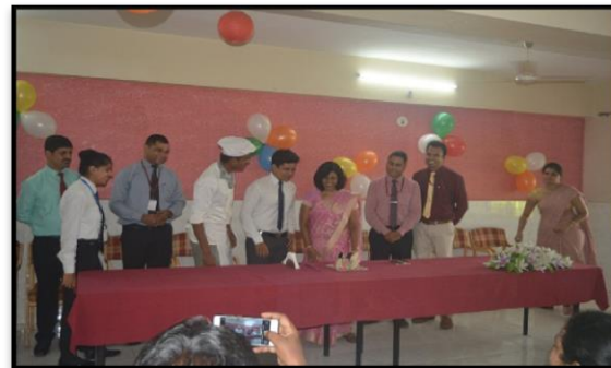
During the celebration