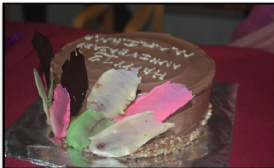
Cake made by T.Y.B.Sc HS Student