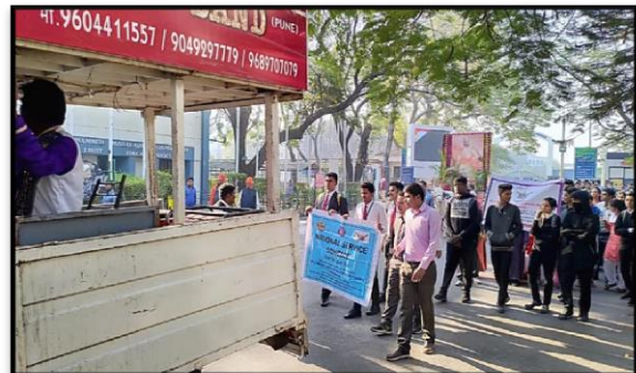
During the Event