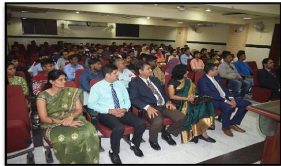
During the event