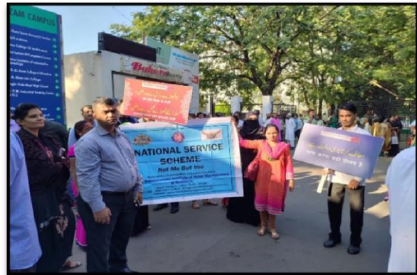
During The Event