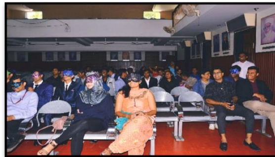
During the event