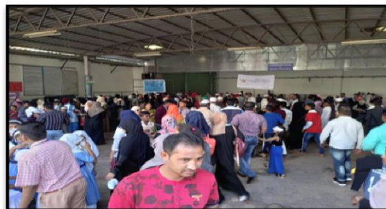
During the Event