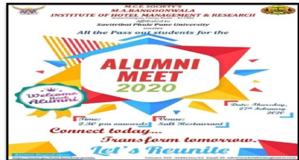
Poster for Alumni Meet