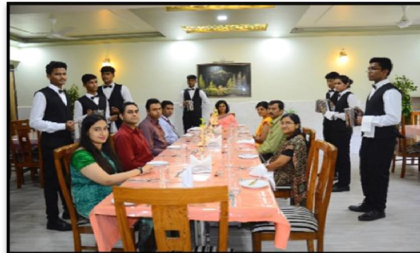
Special service by students