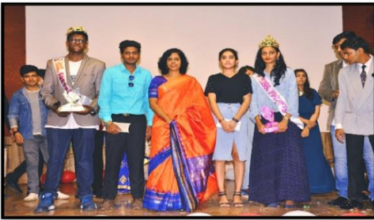
Mr. & Miss. Fresher

“Fresher’s Party” in college is an event which every student eagerly awaits from the time of their admission. 10th August 2019 was a memorable day in the life of every fresher of BSc HS batch 2019-20 at M.C.E Society's M.A. Rangoonwala Institute of Hotel Management and Research. The party was filled with excitement, joy, music, enthusiasm, laughter and happiness. The theme for the party was “Masquerade”.