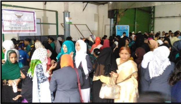
During the Event

M.C.E. Society's M.A.Rangoonwala Institute of Hotel Management & Research distributed refreshments to all campus staff at Badminton Court, Azam campus after the Independence Day celebration.