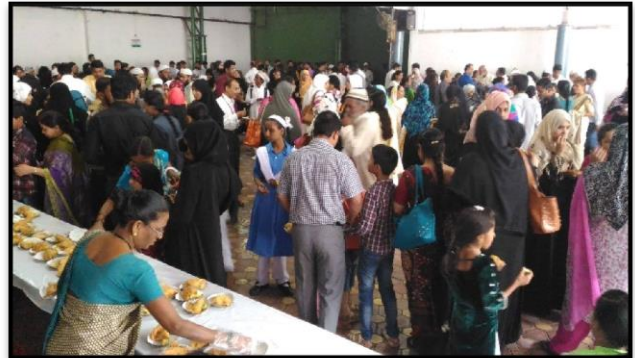
During the Event