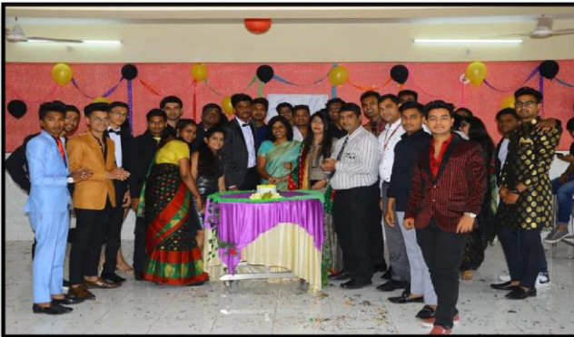
During the session

M.C.E. Society's M.A.Rangoonwala Institute of Hotel Management and Research organized a farewell party for T.Y.BSc. (HS) on 29th Feb, 2020 at 10:00am. The farewell party was planned and executed by F.Y.BSc. (HS).