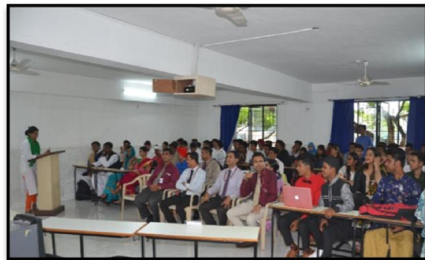
During the Event