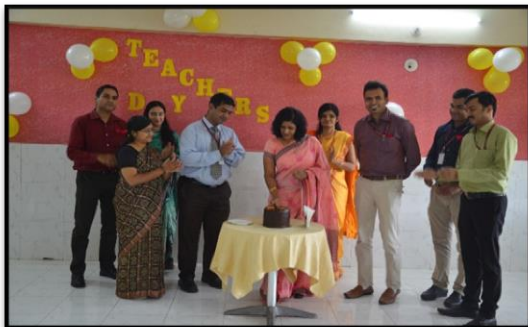
Cake cutting by Principal