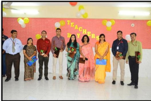
.Group photo of teacher's

Teachers' Day celebration at M.A. Rangoonwala Institute of Hotel Management and Research. Students organized various activities for teachers. T.Y.B.Sc HS students prepared a special lunch and also was synchronized service.