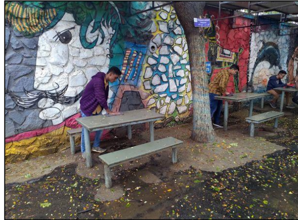
Students cleaning the seating area