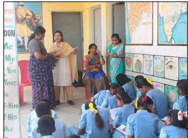
Students reading the books