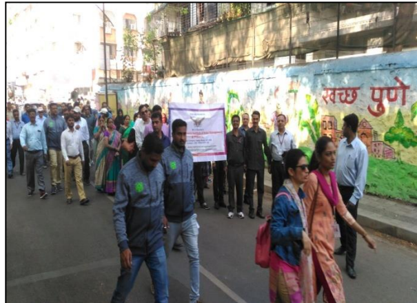
Rally passing through Ramoshi gate