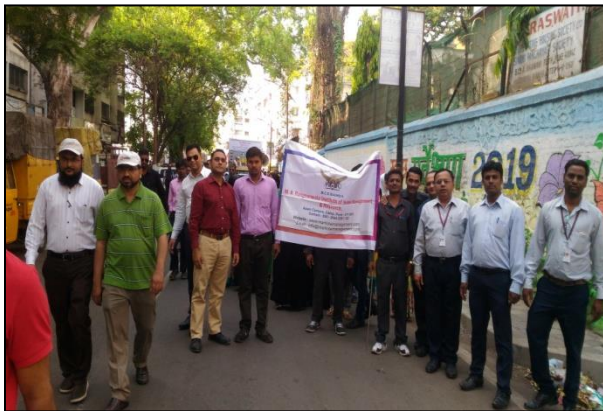
Group photo of the participants