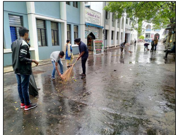
Students cleaning the pathway near school of art