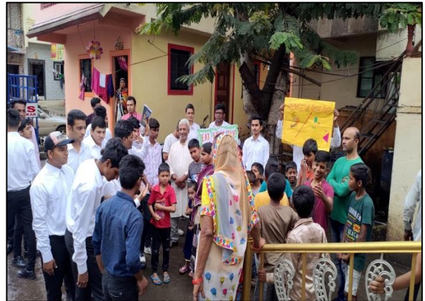
Informing people of Bad Effects of fast Food