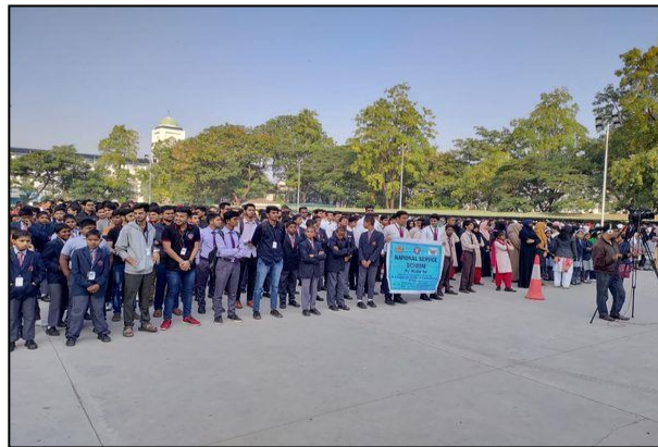
Gathering for the rally in campus