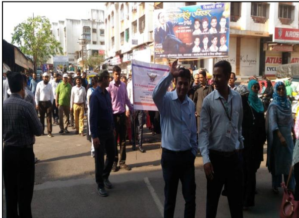
Rally passing through Kashiwadi

National Service Scheme (NSS) wing of M.C.E. Society's M.A.Rangoonwala Institute of Hotel Management and Research participated in the 'Dr. Babasaheb Bhim Rao Ambedkar Jayanti Rally' organized by Hazi Ghulam Mohammed Azam Education Trust, Azam Campus on Sunday, 14th April 2019.