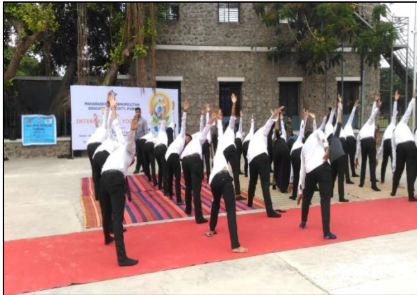
Students performing Yoga on Function ground

National Service Scheme of M.C.E. Society's M.A.Rangoonwala Institute of Hotel Management and Research celebrated 'International Yoga Day 2019' under the directives of University Grants Commission and Savitribai Phule Pune University on Friday, 21st June'2019.