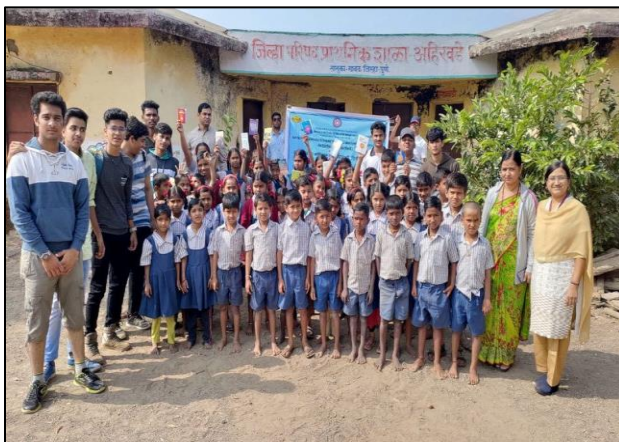
Books distributed at Ahirwade village