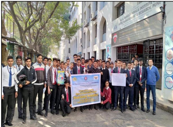
Starting the Walkathon from college gate

M.C.E Society's M.A. Rangoonwala Institute of Hotel Management and Research participated in 31st National Road Safety Week by organizing 'Road Safety Walkathon 2020' on Friday, 17th January 2020 from Azam Campus, Camp to Hotel Aurora Towers, M.G. Road. The college also distributed pamphlets to commuters on road safety rules as laid down by Motor Vehicles (Amendment) Act 2019.