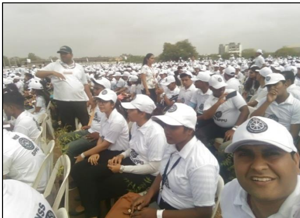
Group photo of the participants