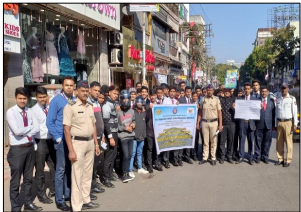
Walkathon contingent with Traffic police members