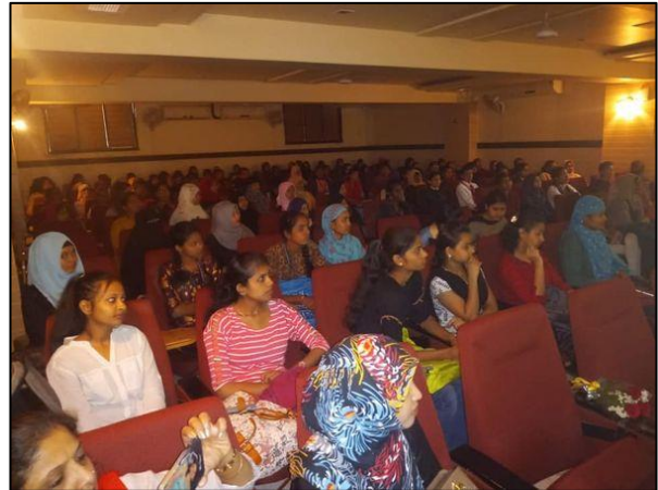
Participating Students and Faculty Members