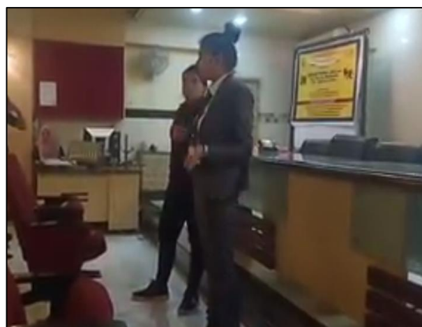
Practice Session with Students