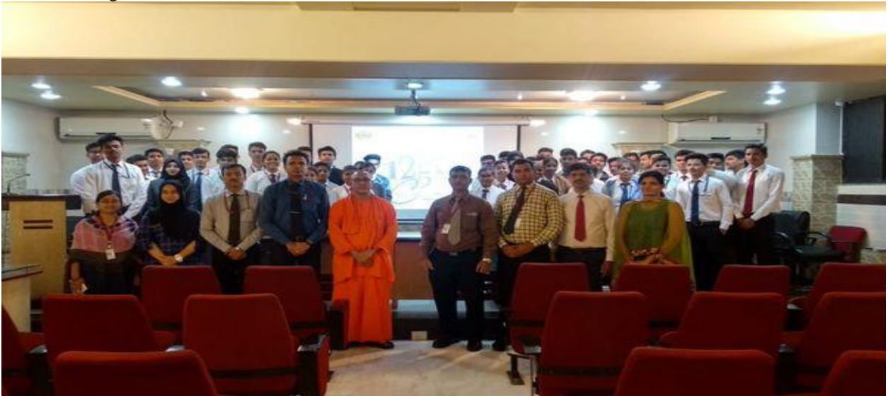
Group photo of the participants