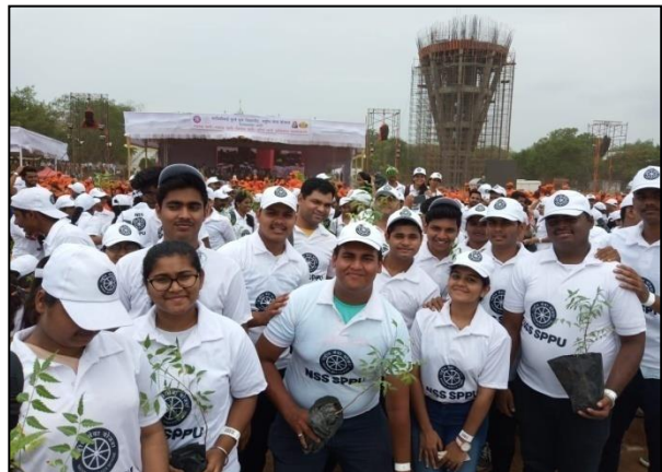
Participants with Neem Saplings