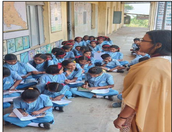
Students reading the books