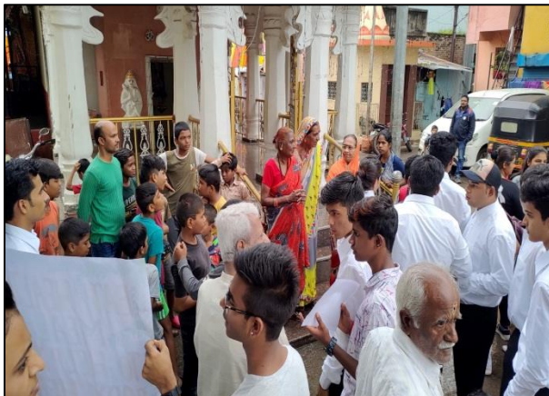
Creating awareness near temple in Kashiwadi area