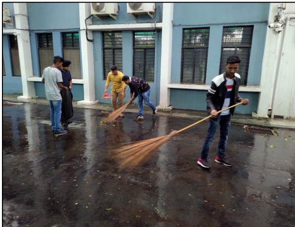
Students cleaning the pathway near pharmacy college