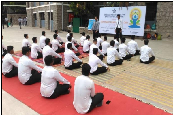
Students understanding the importance of Yoga