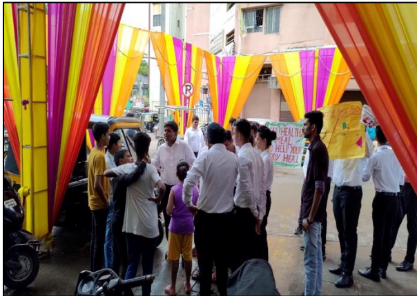
Informing people of Fit India Movement at kashiwadi market

M.C.E Society's M.A. Rangoonwala Institute of Hotel Management and Research organized an NSS activity under Fit India Movement Awareness drive 'Impact of Fast Food on Health' in the kashiwadi slum area. Students created awareness about bad health effect of eating fast food on regular basis.