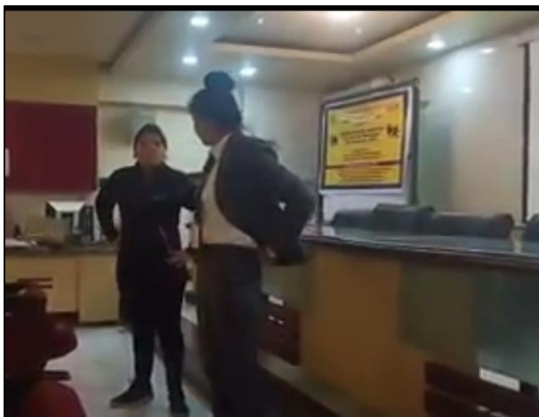
Practice Session with Students