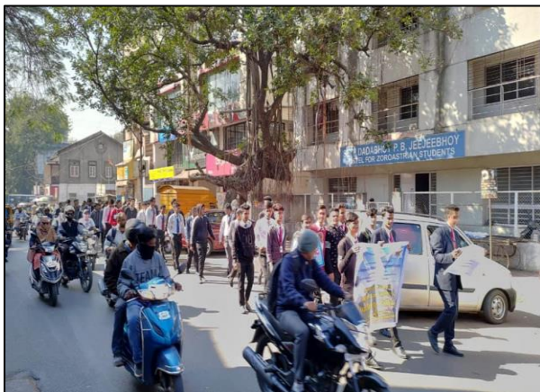
Walkathon on the way back to campus