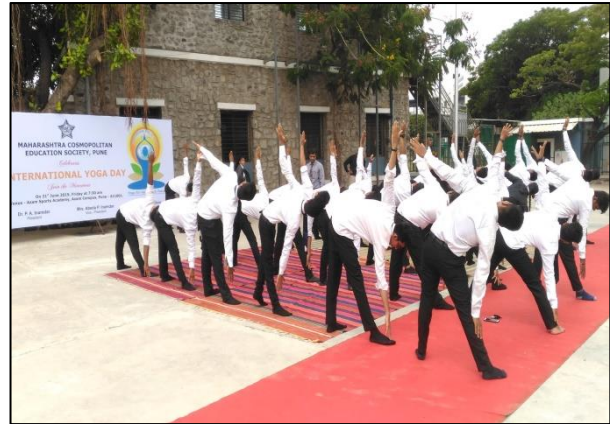
Students performing Yoga on Function ground