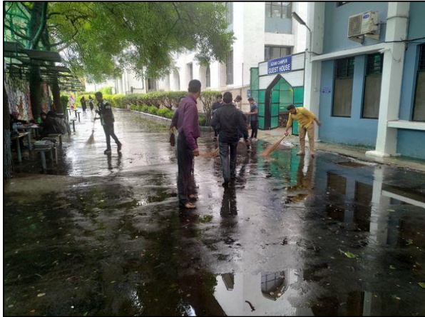
Students cleaning the pathway near guest house

Students of M.C.E. Society's M.A.Rangoonwala Institute of Hotel Management and Research did the cleaning of Campus premises on Thursday, 08th Aug'2019. The activity was organized as a part of the 'Swaccha & Swastha Bharat Abhiyan Pakhwada' under National Service Scheme of Savitribai Phule Pune University.