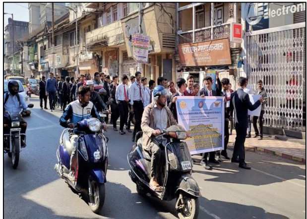
Walkathon on the way to Hotel Aurora Towers