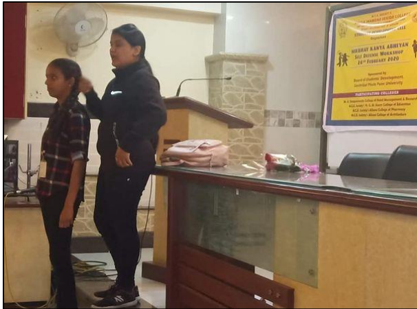
Demonstration by the Resource Person

M.C.E. Society's M.A. Rangoonwala Institute of Hotel Management and Research participated in the Self-Defence Workshop organized by Board of Student Development under Nirbhaya Kanya Abhiyaan on 24th February 2020.