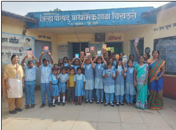
Books distributed at Chikhalse village

M. C. E. Society's M. A. Rangoonwala Institute of Hotel Management & Research organized Books distribution activity on 20th December 2019 in Zilla Parishad shala at Chikhalse & Ahirwade village, Kamshet on old Mumbai-pune highway. The activity was conducted to inculcate reading habit among students and books on "Self-improvement and Personality Development" were distributed to all students.