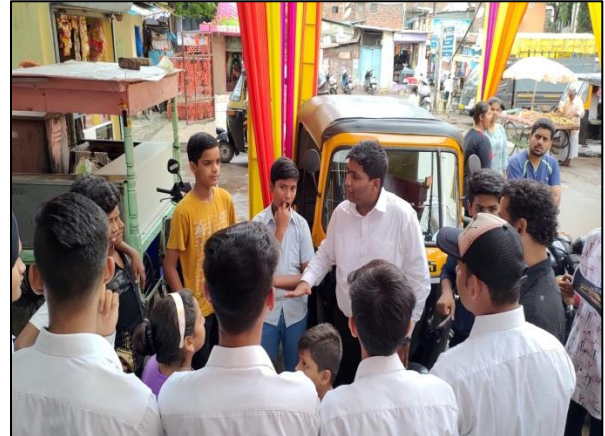
Creating awareness to children