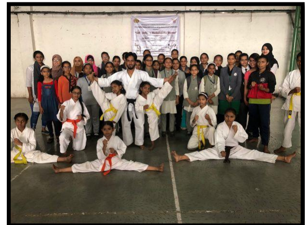
Group photo with the second group of participants