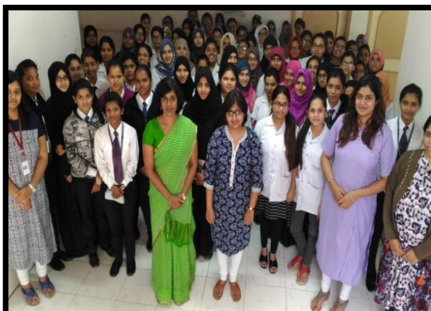
Group photo with the participants