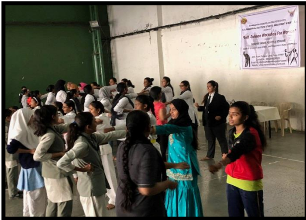
A warm-up session for the participant's