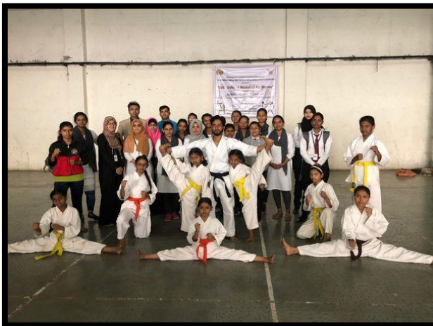
Group photo with one group of participant