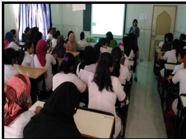
Presentation by the resource person