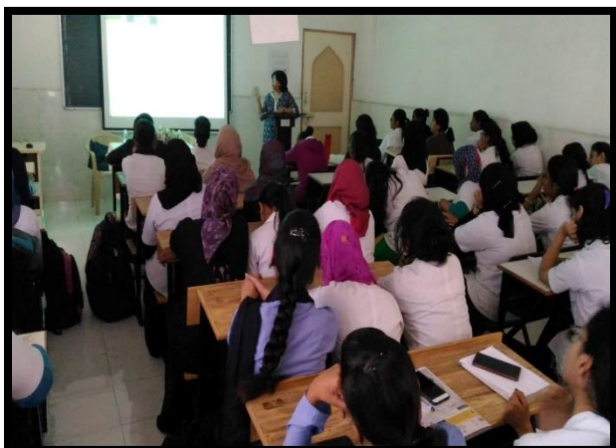
Girls students asking the questions