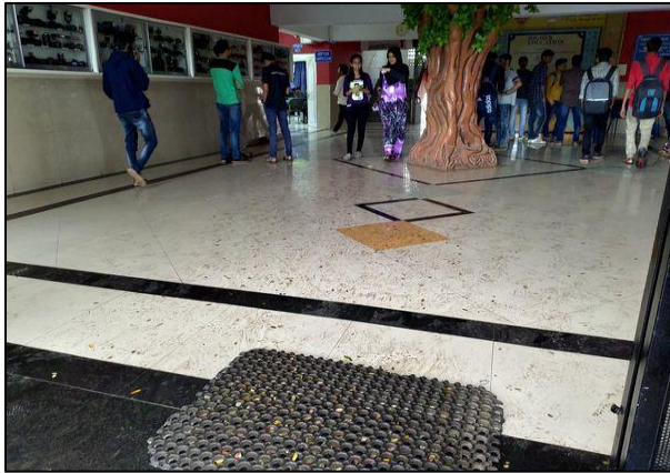
Floor before the cleaning

Students of M.C.E. Society's M.A.Rangoonwala Institute of Hotel Management and Research did the cleaning of College premises on Wednesday, 07th Aug'2019. The activity was organized as a part of the 'Swaccha & Swastha Bharat Abhiyan Pakhwada' under National Service Scheme of Savitribai Phule Pune University.