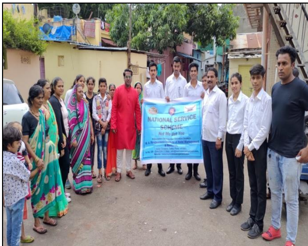
Informing housewives at Kashiwadi area