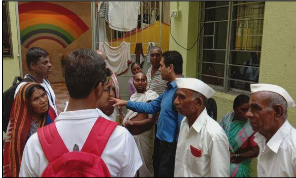
Distributing Patravalis to Warkari Group at Bhavani Peth