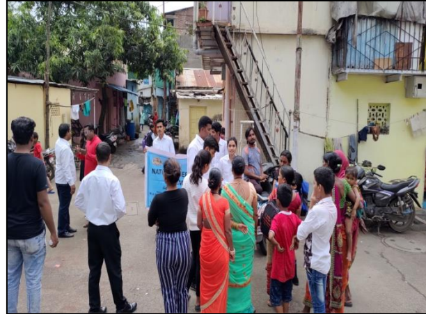
Informing parents of school children at Kashiwadi area