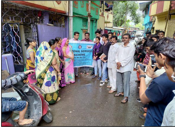
Informing people of Swacch bharat abhiyan at kashiwadi entrance

Students of M.C.E. Society's M.A.Rangoonwala Institute of Hotel Management and Research visited Kashiwadi slums to create awareness about cleanliness & health on Thursday, 08th Aug'2019. The activity was organized as a part of the 'Swaccha & Swastha Bharat Abhiyan Pakhwada' under National Service Scheme of Savitribai Phule Pune University.