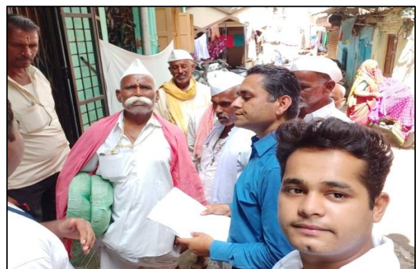
Distributing Patravalis to Warkari Group at Palkhi Chowk