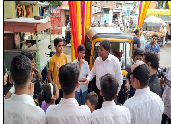
Creating awareness to children