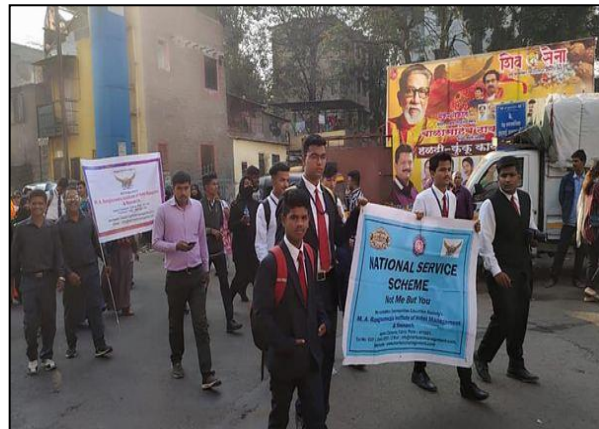
Rally entering the Mahatma Phule wada