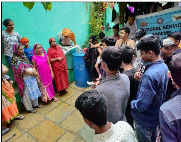
Creating awareness at homes in kashiwadi area