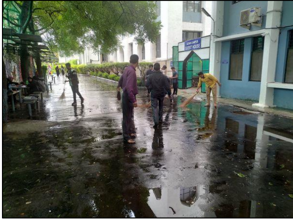
Students cleaning the pathway near guest house

Students of M.C.E. Society's M.A.Rangoonwala Institute of Hotel Management and Research did the cleaning of Campus premises on Thursday, 08th Aug'2019. The activity was organized as a part of the 'Swaccha & Swastha Bharat Abhiyan Pakhwada' under National Service Scheme of Savitribai Phule Pune University.