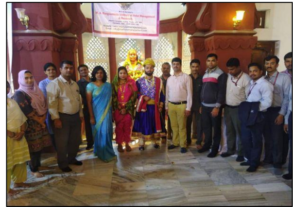
Group Photo at Lal Mahal