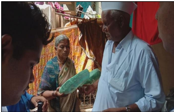
Distributing Patravalis to Warkari Group at Ramoshi Gate