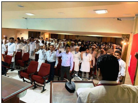
Front view while taking the Pledge