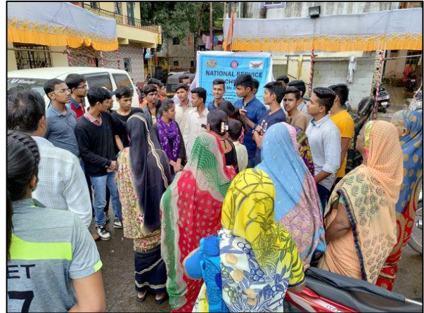
Informing people of Swacch bharat abhiyan