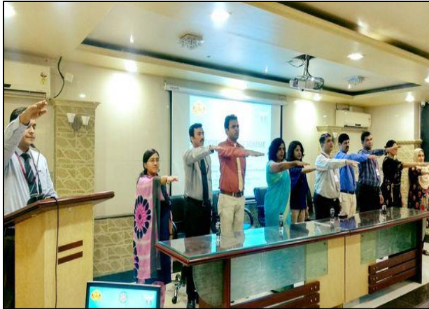
Faculty members taking the Pledge

M.C.E Society's M.A. Rangoonwala Institute of Hotel Management and Research participated in 'Swacch Bharat Pledge' directed by Ministry of Youth Affairs and Sports, Directorate of NSS, New Delhi under National Service Scheme, Savitribai Phule Pune University on Thursday, 1st August 2019.