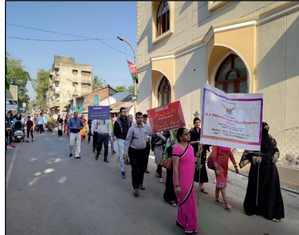
Staff participation in the rally