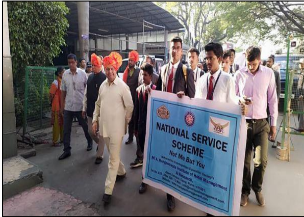
Students and Staff leaving the Campus

National Service Scheme (NSS) unit of M.C.E Society's M.A. Rangoonwala Institute of Hotel Management and Research participated in the rally from Azam Campus to Lal Mahal on the occasion of 'Chhatrapati Shivaji Jayanti' on 19th February 2020 to spread the teachings of Chhatrapati Shivaji Maharaj to the society.