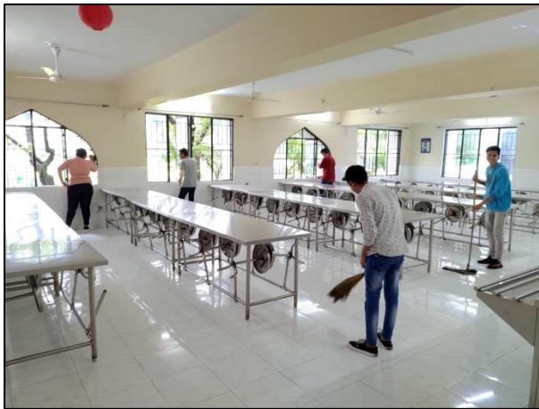
Students cleaning the dining hall