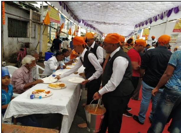
Serving the food in Langar

M.C.E Society's M.A. Rangoonwala Insitute of Hotel Management and Research conducted NSS Social Service Activity on the occasion of 550th Guru Nanak Jayanti on 12th November 2019. The students participated in the Langar to serve the people at the Gurudwara, Ganesh Peth, Pune.