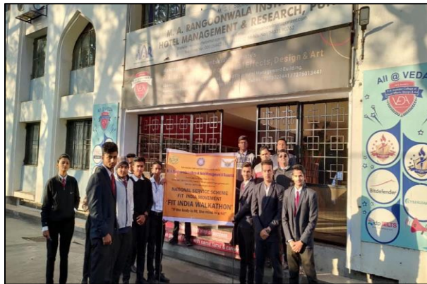
Starting the Walkathon from college gate

M.C.E. Society's M.A. Rangoonwala Institute of Hotel Management and Research participated in the Fit India Movement by organising 'Fit India Walkathon 2020' on Saturday, 18th January 2020. Route for the Walkathon was from Azam Campus- Poolgate-General Bhagat Marg-Hidayatullah Road-Azam Campus. This activity was conducted under the directives of Government of India, Ministry of Youth Affairs & Sports, Department of Youth Affairs and Directorate of NSS, New Delhi, Government of Maharashtra, Directorate of NSS, Pune and Savitribai Phule Pune University's National Service Scheme.