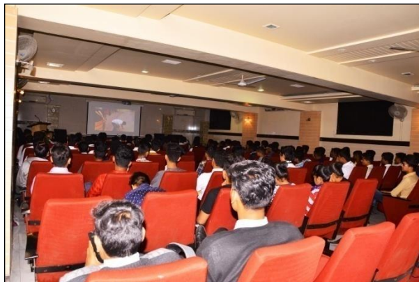
Session in progress