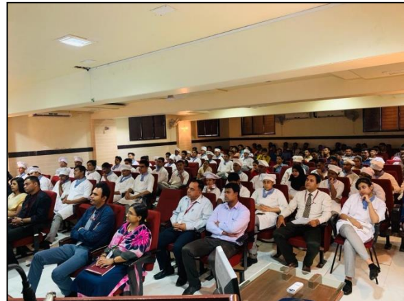
Watching the video on Impact of Tobacco on Society