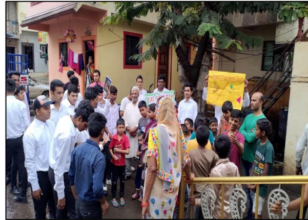
Informing people of Bad Effects of fast Food