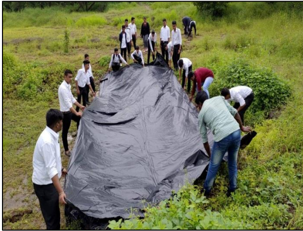
Creating artificial pond for water storage

M.C.E Society's M.A. Rangoonwala Institute of Hotel Management and Research organized an activity 'Save the environment: Tree plantation and maintenance' under National Service Scheme. Students went to Anandvan and did maintenance work for preserving the plants, creating artificial pond for water storage and ploughed to create water stream for water collection in pond.