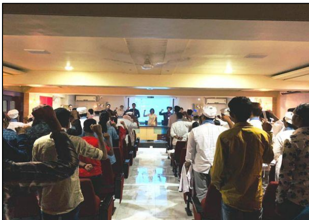
Back view while taking the Pledge