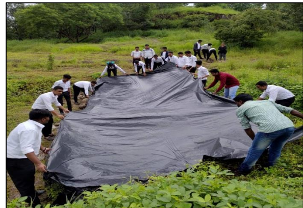
Finishing the laying of plastic at the bottom of the pond