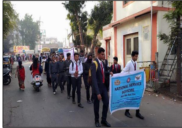
Rally at Ramoshi Gate