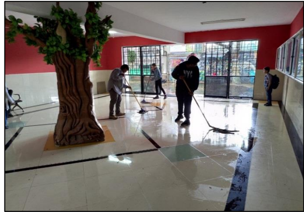
Students cleaning the Floor