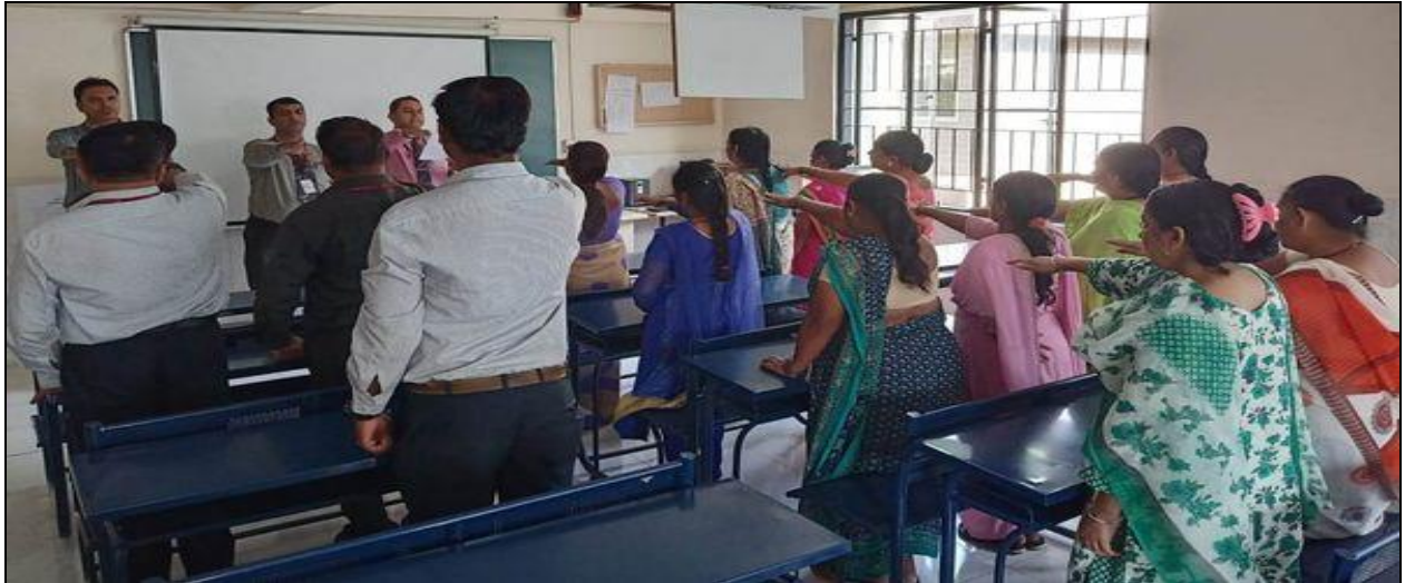
View of pledge taking from back

Staff and students of M.C.E. Society's M.A.Rangoonwala Institute of Hotel Management and Research under the 'Swaccha & Swastha Bharat Abhiyan' program of National Service Scheme, Savitribai Phule Pune University, pledged not to smoke or consume any type of tobacco products in their life and also to motivate family or acquaintances to follow the same. A promise was made to self to keep the campus & office premises clean and tobacco-free at all times.