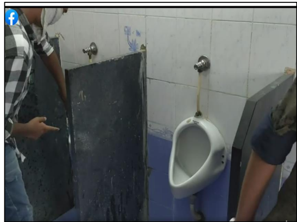
Students cleaning the toilet