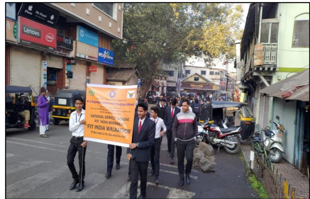
Walkathon on the way Gurudwara road