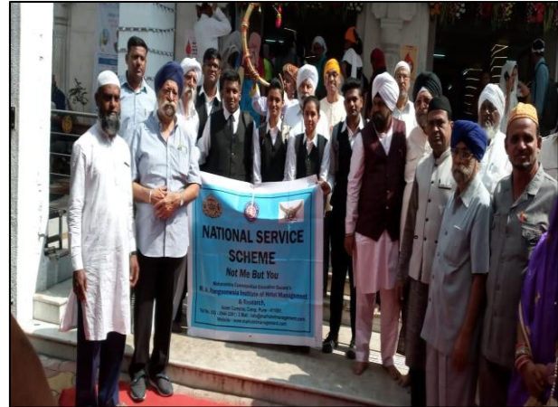
Group photo with Gurudwara Committee Members