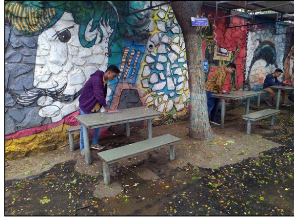
Students cleaning the seating area