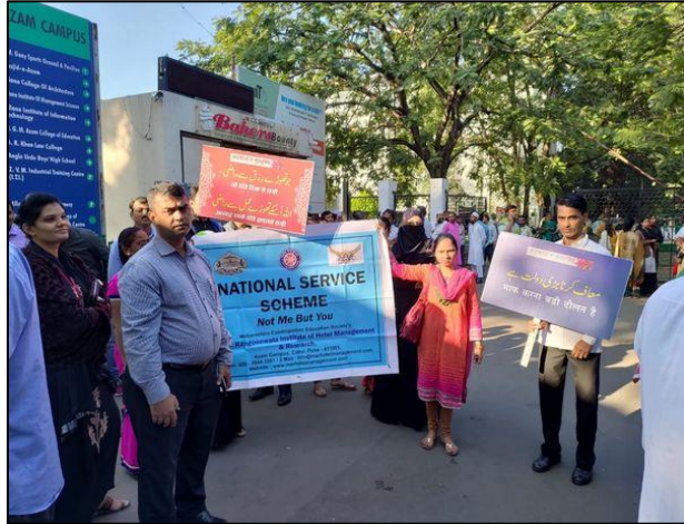
Starting of rally at gate no. 1

M.C.E Society's M.A. Rangoonwala Institute of Hotel Management and Research participated in the rally on occasion of Eid-e-Milad on 12th November 2019.