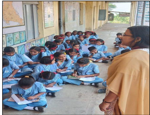
Students reading the books