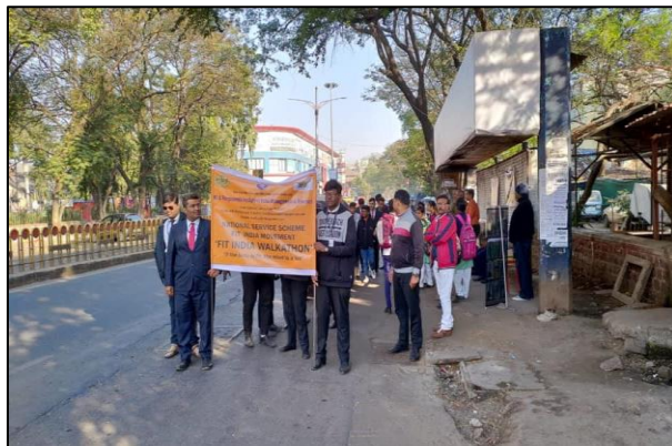
Walkathon on the way back to campus