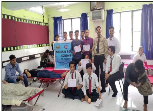
Students with their appreciation certificate