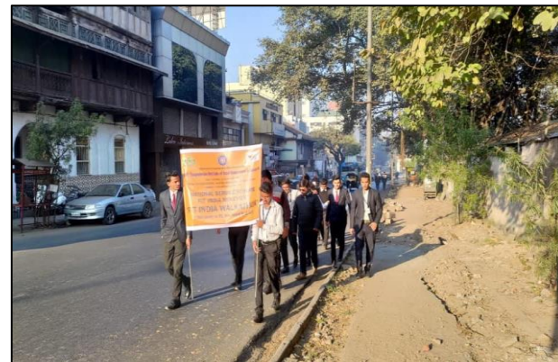
Walkathon contingent with Traffic police members