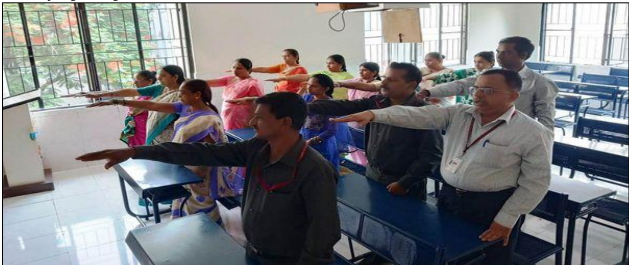
View of Pledge taking from side