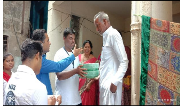
Distributing Patravalis to Warkari Group at Timber Market