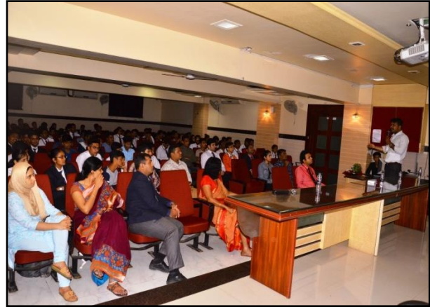
Session in progress