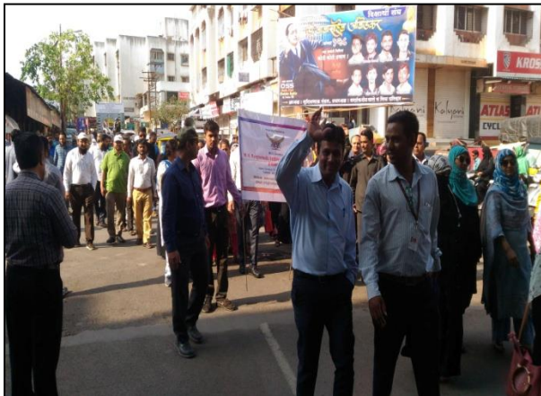
Rally passing through Kashiwadi

National Service Scheme (NSS) wing of M.C.E. Society's M.A.Rangoonwala Institute of Hotel Management and Research participated in the 'Dr. Babasaheb Bhim Rao Ambedkar Jayanti Rally' organized by Hazi Ghulam Mohammed Azam Education Trust, Azam Campus on Sunday, 14th April 2019.