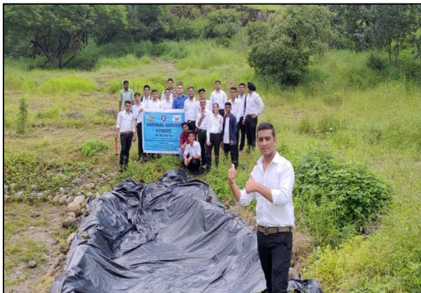
After finishing the work