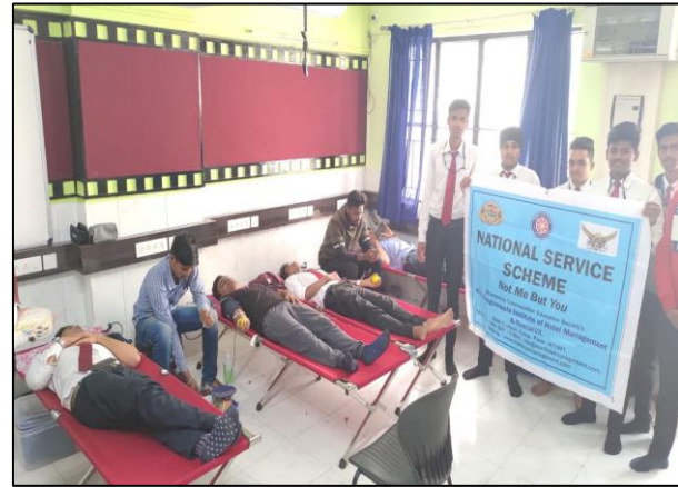
Students donating the blood