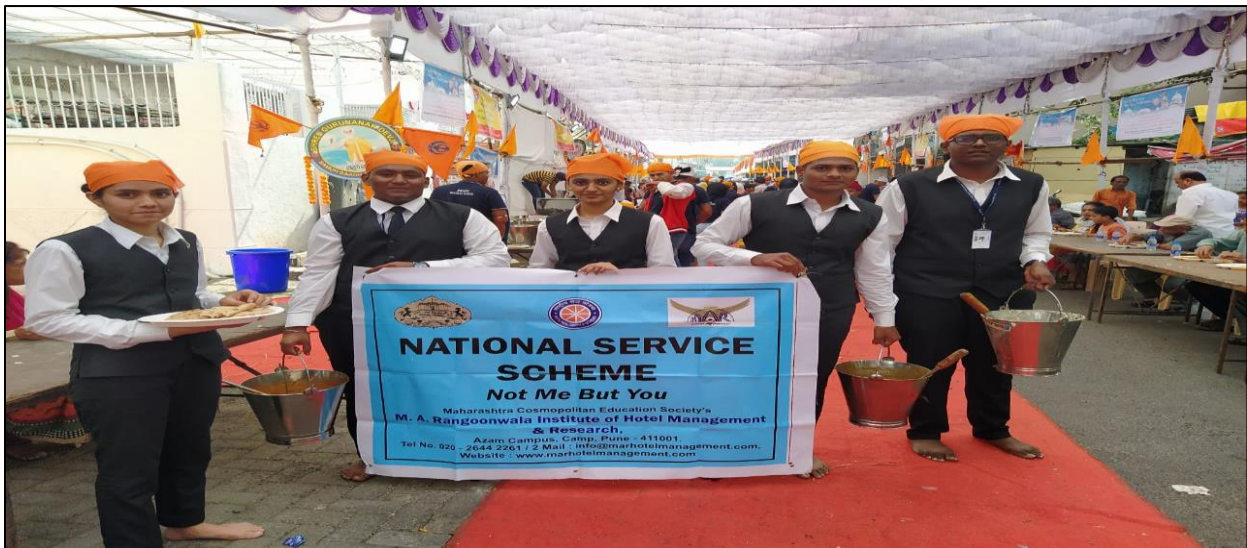
Students with NSS Banner