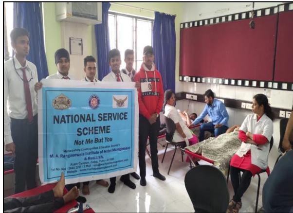
Students donating the blood

M.C.E Society's M.A. Rangoonwala Institute of Hotel Management and Research organized 'Blood Donation Camp' on Saturday, 17th December 2019 in our college premises. Students went for the blood donation awareness drive to all colleges in azam campus and poona college in the preceding week from the day of the camp. We collected 55 bottles of blood to save life in emergency medical cases.