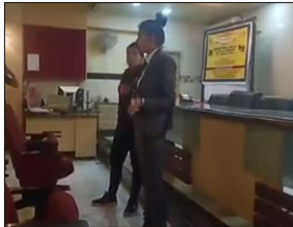
Practice Session with Students