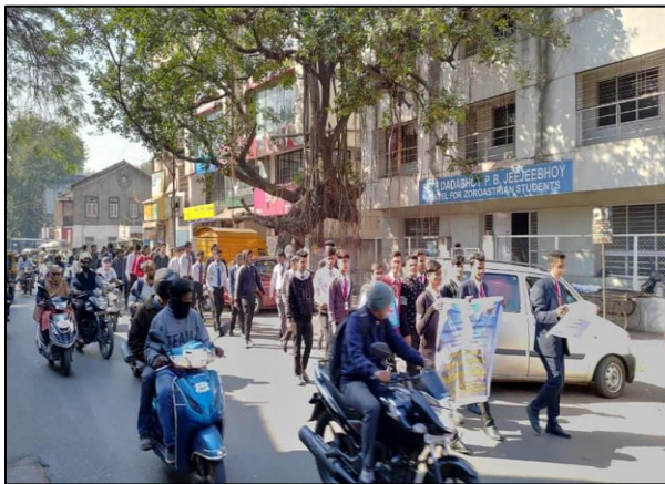
Walkathon on the way back to campus