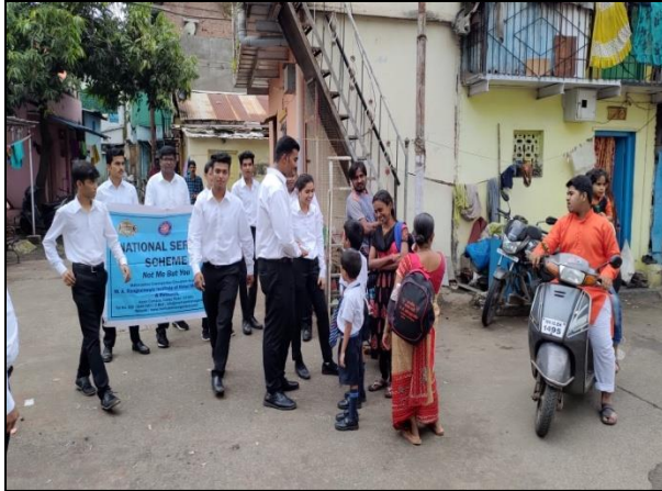
Informing children of school children at Kashiwadi area

Students of M.C.E. Society's M.A.Rangoonwala Institute of Hotel Management and Research visited Kashiwadi slums to create awareness about Malnutrition in Children Wednesday, 11th Sept 2019. The activity was organized as a part of the 'Fit India Movement' under National Service Scheme of Savitribai Phule Pune University.