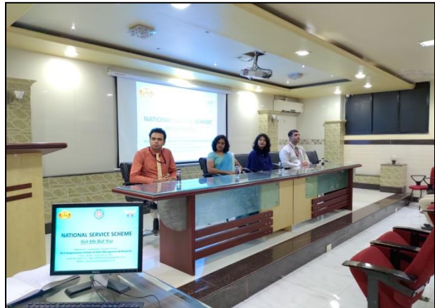
Session on Swacch Bharat activities