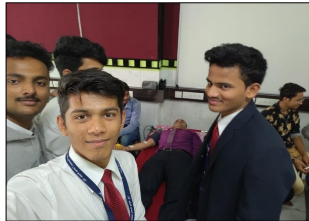
NSS Program Officer donating the blood