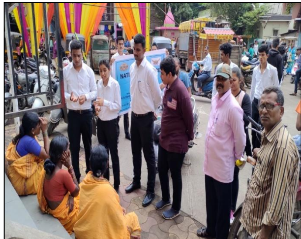
Informing housewives at Kashiwadi area