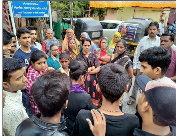
Creating awareness to shopkeepers