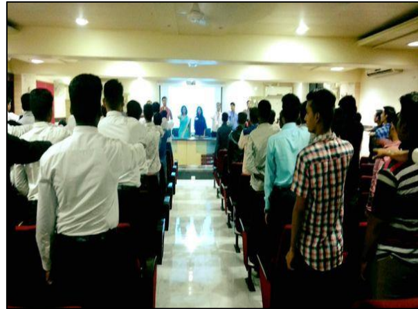
Students taking the Pledge