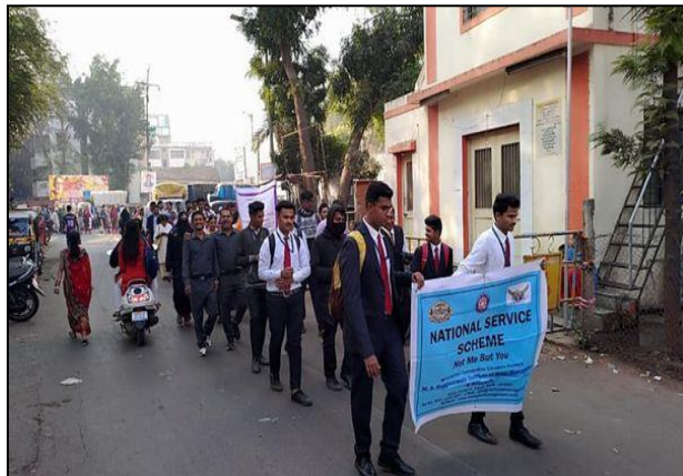
Students participation in the rally