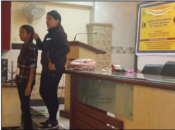
Demonstration by the Resource Person

M.C.E. Society's M.A. Rangoonwala Institute of Hotel Management and Research participated in the Self-Defence Workshop organized by Board of Student Development under Nirbhaya Kanya Abhiyaan on 24th February 2020.