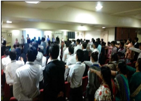
Non-Teaching members taking the Pledge