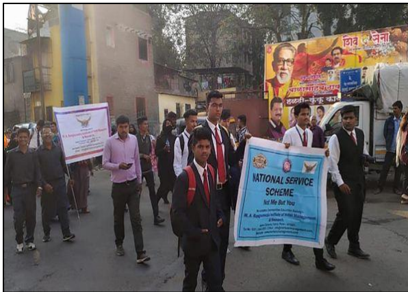
Rally near Lal Mahal