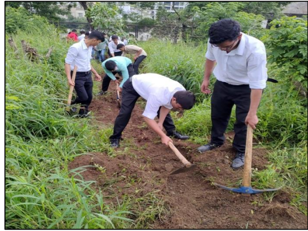
Ploughing the path for water stream