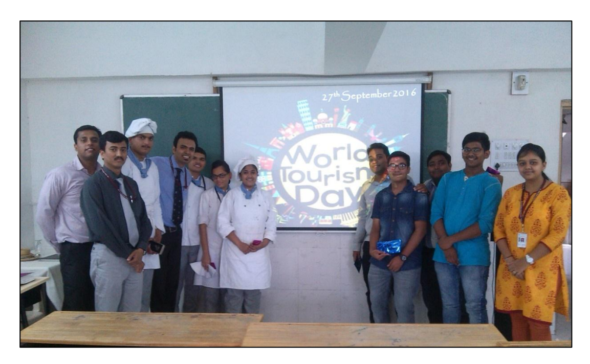
Quiz Competition on World Tourism Day held on 27<sup>th</sup> September 2016