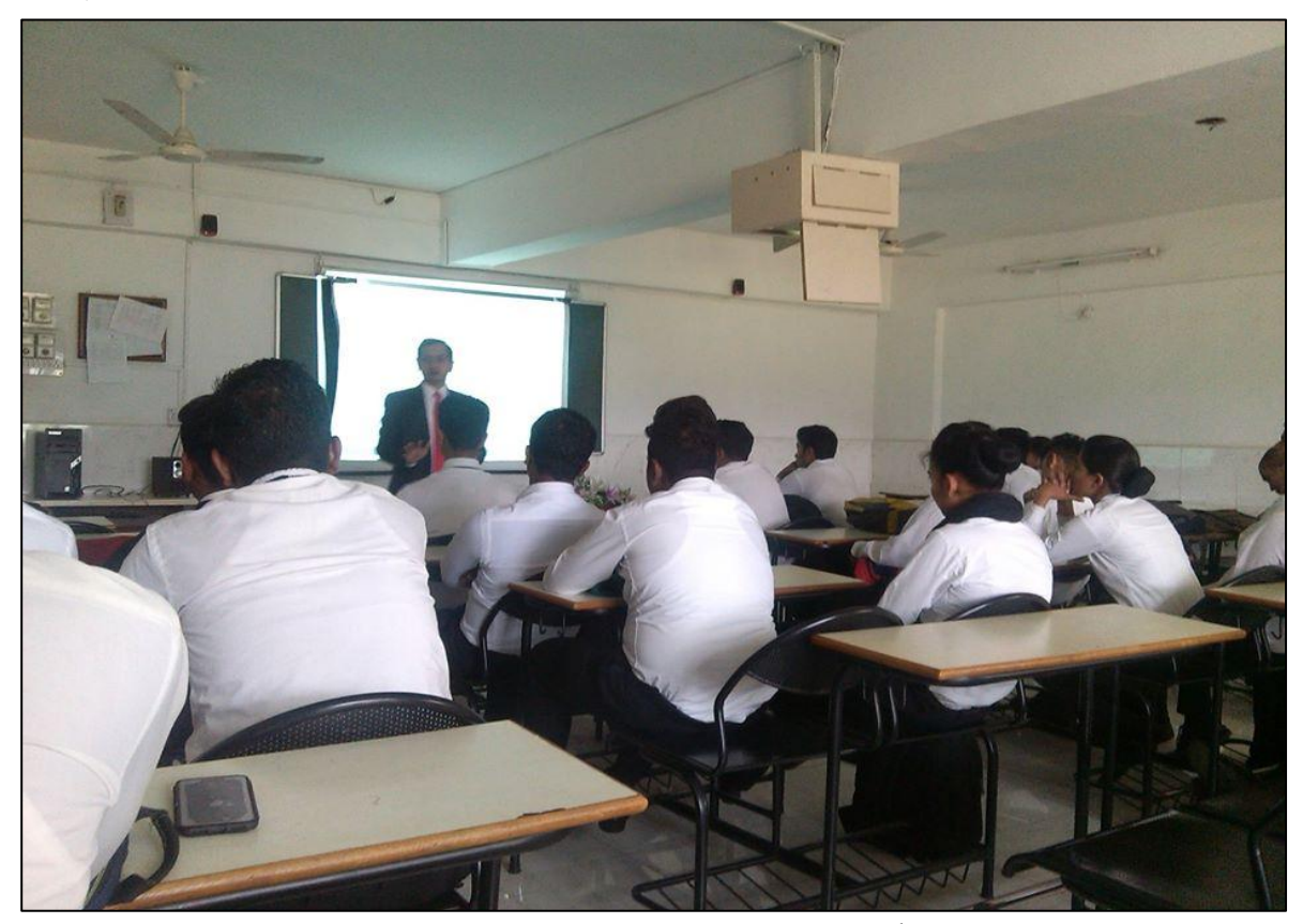
Guest Lecture on Grievance Handling held on 17<sup>th</sup> March 2018