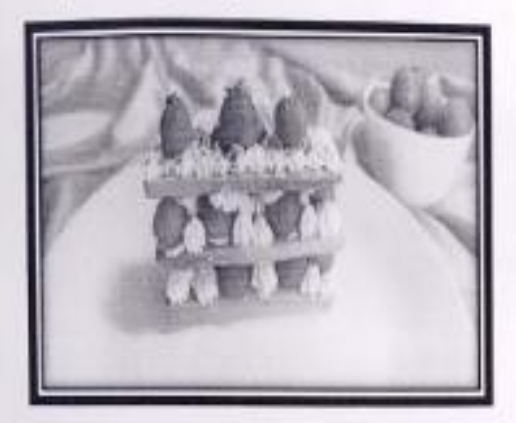
Pastry Making Competition