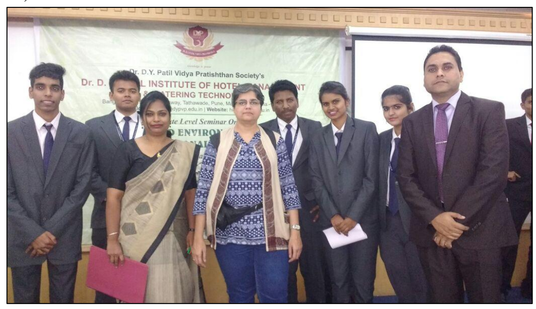
Green Audit Seminar attended at Dr. D.Y. Patil IHMCT on 08<sup>th</sup> February 2017