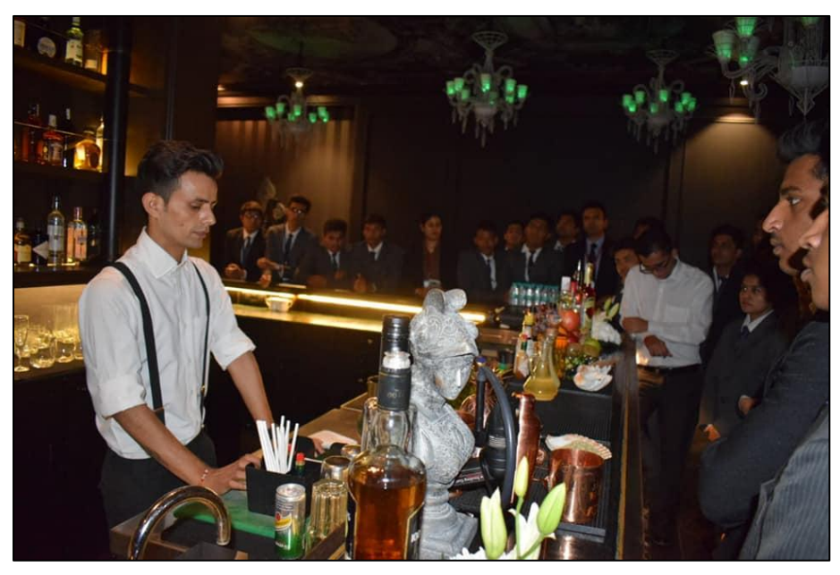
Cocktail & Mocktail demonstration at Westin Pune held on 29<sup>th</sup> August 2018