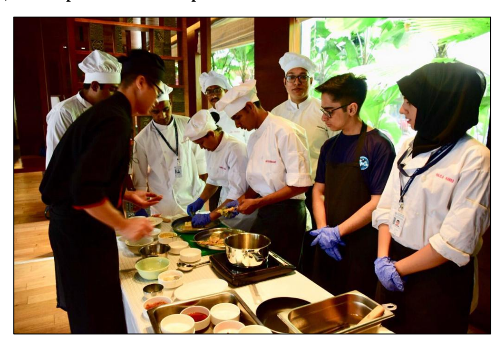
Thai Cuisine Workshop at Hyatt Pune held on 6<sup>th</sup> August 2018