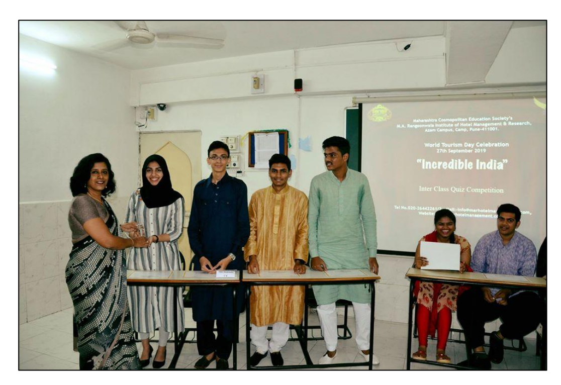
Quiz Competition on World Tourism Day held on 27<sup>th</sup> September 2019