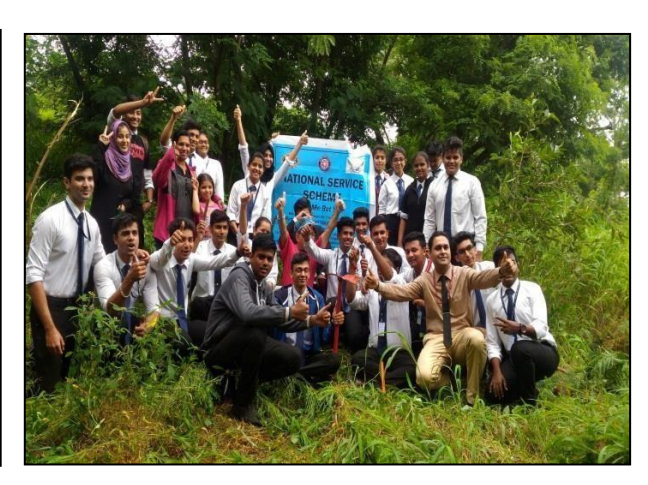
Group photo of the students