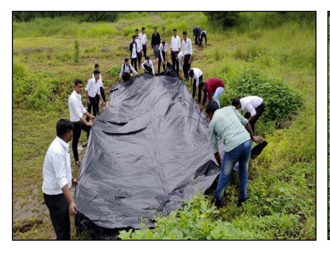
Creating artificial pond for water storage

M.C.E Society's M.A. Rangoonwala Insitute of Hotel Management and Research organized an activity 'Save the environment: Tree plantation and maintenance' under National Service Scheme. Students went to Anandvan and did maintenance work for preserving the plants, creating artificial pond for water storage and ploughed to create water stream for water collection in pond.