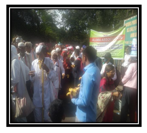
Distribution of Fruits