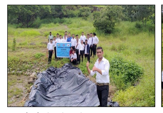
After finishing the work pond